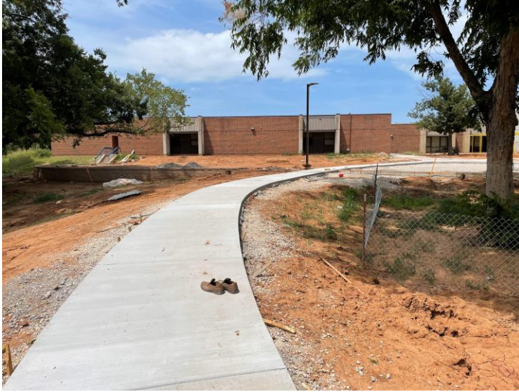
RETAINING WALL AT NEW PLAY AREA