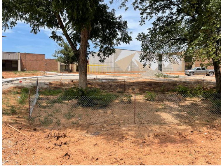
NINE SQUARE AND OUTDOOR RECREATIONAL AREA