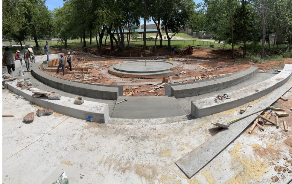
AMPHITHEATER SEATING AND PLATFORM