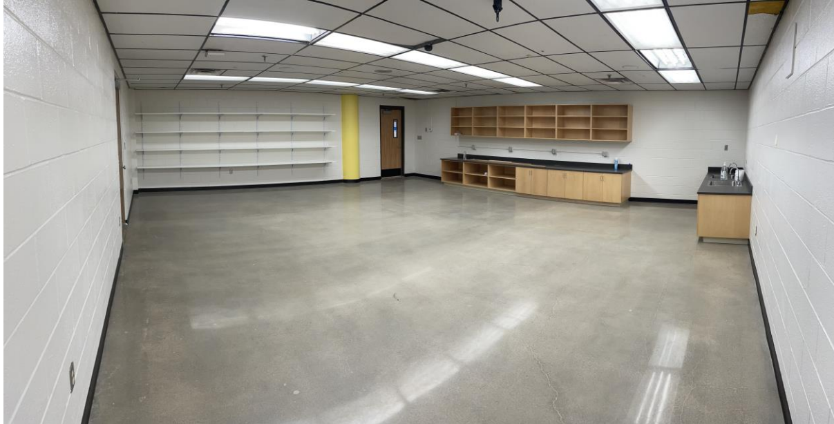
VIEW OF RENOVATED STEAM ROOM (ART ROOM)