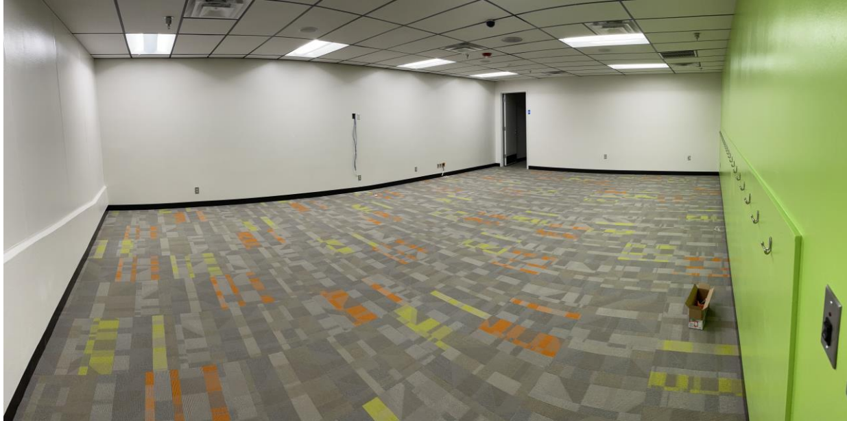
VIEW OF RENOVATED CLASSROOM